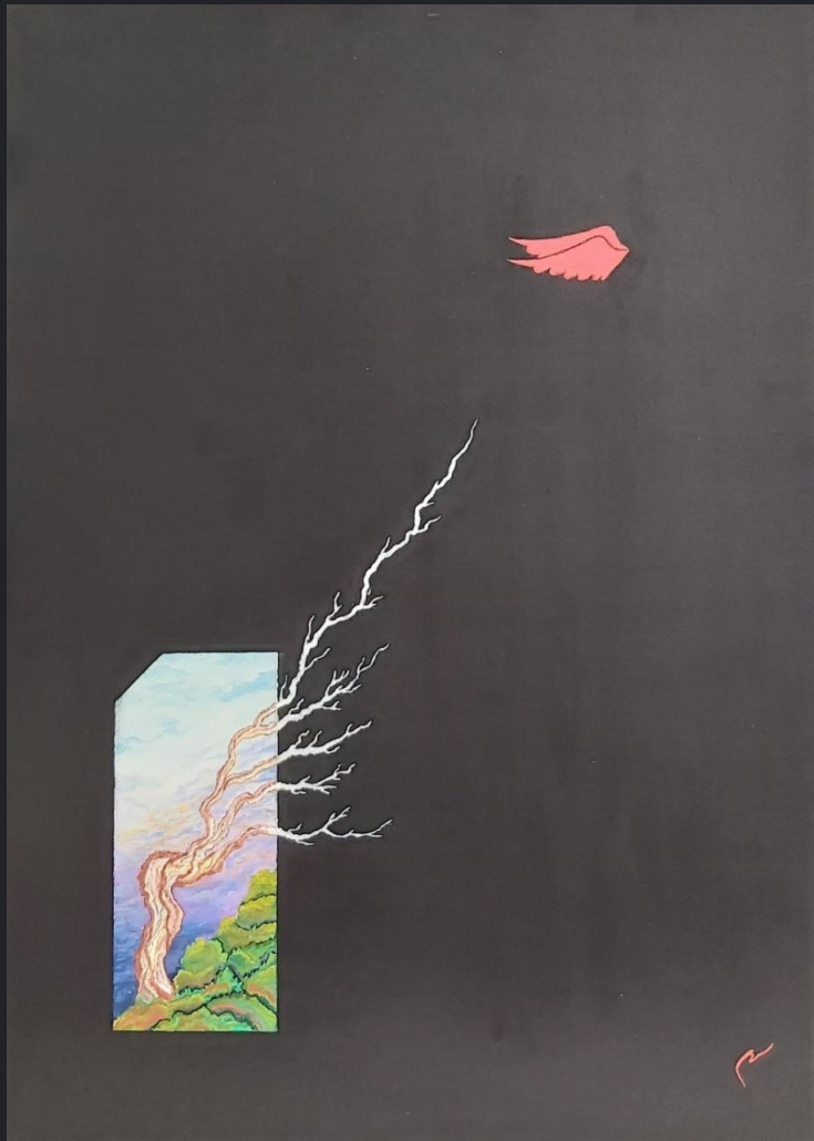
Work 4A – The bird left; the loving tree remained