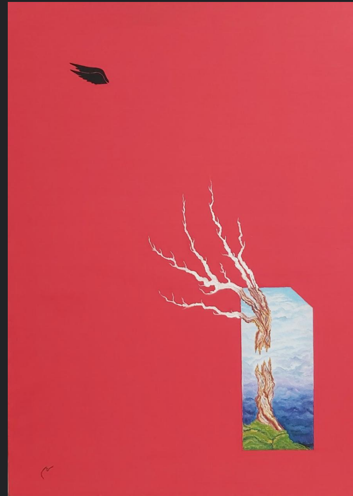
Work 4B – The Plane Tree's Prostitution, for a Hideous Crow